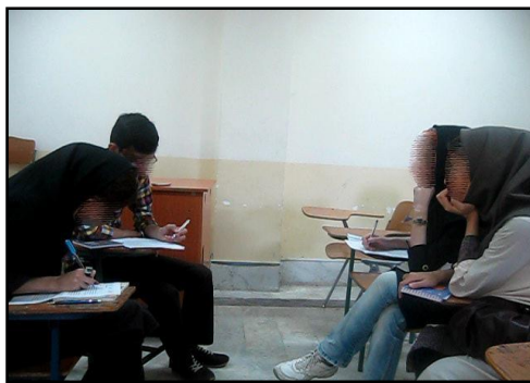
Figure 3. The learner writing the revision.