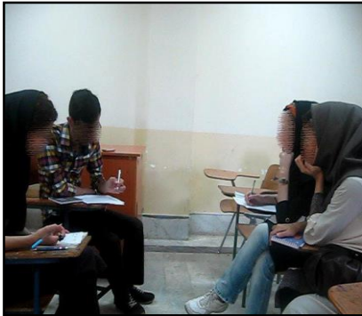
Figure 1. Provision of DIU.

The silence is a very important component of a DIU, especially in writing conferences. As Koshik (2008) illustrates, when the learners complete the utterance, teachers evaluate their responses; thus, DIUs are generally treated as question-answer sequences. If the learner is not provided with enough time to think (line 5), the DIU may not result in a successful revision on the text.