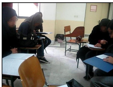
Figure 5. gazing at the draft.