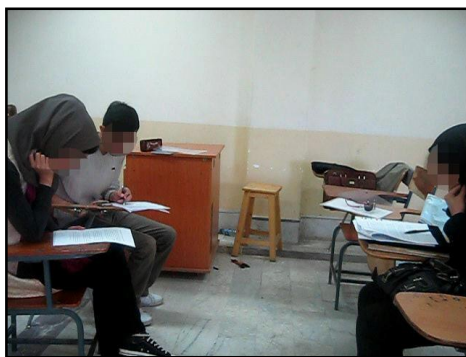
Figure 6. The learner gazing and thinking.

In this extract, the silence also served as a room in which the learner could think about the question asked in the conference and also prepare to answer the question.