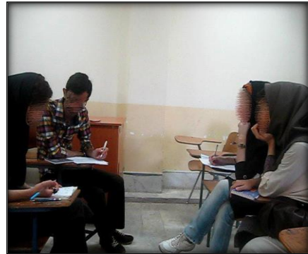
Figure 2. The learner gazing at the paper.