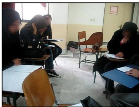
Figure 4. Silence; the learner bends towards draft.

The silence can be considered as one of the crucial elements of the learner's successful revision in writing conferences. As Rowe (1986) states, it is difficult for many teachers to reach an average wait time up to 3 seconds or longer. She further suggests that if teachers succeed in reaching this average, "there are pronounced changes in student use of language..." (ibid., p. 43). Accordingly, the appropriate use of wait time by the teacher (line 35) can be considered as a key in the participation, first and foremost, and also the right answer made by the learner.